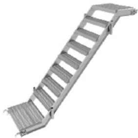
STAIRS & ACCESS