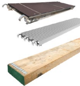
PLANKS / PLATFORMS